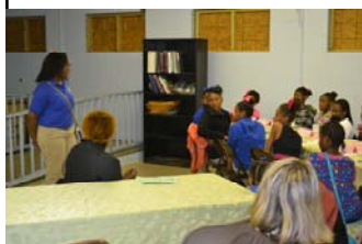
Emerging Young Leaders speak at “Leadership Tea”.

For the past four months, the Omicron Beta Omega Chapter of Alpha Kappa Alpha Sorority have met with emerging Western Gardens Leaders immediately afterschool twice a month on Wednesdays. The AKA leaders spend an hour supporting, developing, and exposing the girls to opportunities that will enhance a strong foundation and personal success. Research has reported that middle school is a crucial period as impressionable young girls deal with issues of becoming a teenager, peer pressure/relationships, hormone changes, and negative body development from the media and society. To celebrate the young ladies’ accomplishments thus far, a formal tea was held Wednesday, April 24, 2013, to allow the participants to showcase their etiquette. MHA would like to thank the Alpha Kappa Alpha Sorority for their “Commitment to Excellence” in the Meridian Community!