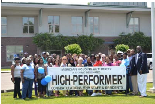
MHA celebrating "High Performer" designation

The Department of Housing and Urban Development (HUD) has completed its annual Public Housing Assessment of administrative operations at the Meridian Housing Authority for fiscal year end 2012. HUD evaluates the management of all Housing Authorities in the following categories: (1) Finance (2) Management (3) Facilities and (4) Capital Funding. After the completion of the HUD review, the Meridian Housing Authority has been designated as a "High Performer" scoring 92 out of a possible 100 points. Because of this distinction, MHA will receive an additional 20% funding allocation which will be used to make much needed capital repairs throughout the agency. MHA will also remain eligible to apply for certain HUD grants only offered to high performing agencies.