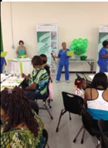
BEEP presents to the participants

The B.E.E.P. (Basic Early Education Practices) celebrated one year of service to the residents of Meridian Housing Authority. This event highlighted the services and activities that were conducted by the B.E.E.P. Program. Residents from Mt. View, Frank Berry Courts, Magnolia Courts, George Reese Courts, and Western Gardens were in attendance. Everyone enjoyed catered food from Weidman's Restaurant along with a special celebratory cake. Family members along with MHA staff were on hand to congratulate everyone who participated in the BEEP program. BEEP is now gearing up to serve more residents in additional locations in efforts to provide much needed child educational services. Anyone interested in enrolling in the BEEP program, please contact MHA CSS Department.