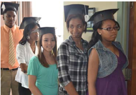
MHA residents preparing to receive their scholarship award