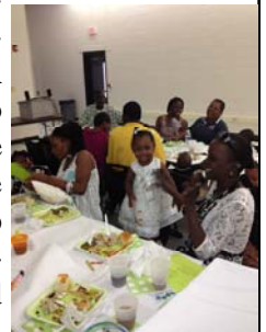
Residents having a great experience at the BEEP celebration