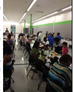
Large resident attendance at the BEEP Celebration