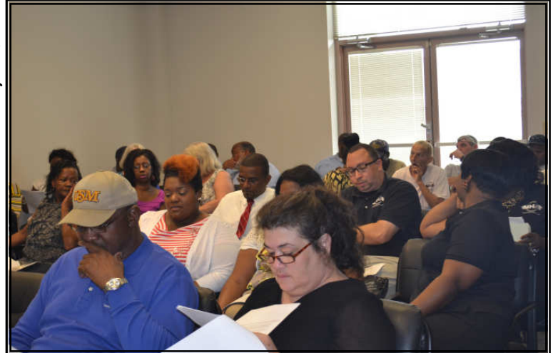
MHA Employees Participate Planning Process

The Meridian Housing Authority is currently in the process of starting its comprehensive planning efforts for the upcoming fiscal year. This strategic planning process is designed to inform MHA residents, HUD officials and the general public of the organization's intent to effectively serve the immediate needs of over 3,600 eligible residents. There are approximately 1215 public housing apartments scattered throughout the City of Meridian. Several strategies are currently being evaluated including the total revitalization of Meridian's East End. The major thrust of this effort is to submit a Choice Neighborhood Implementation application to HUD to redevelop the George Reese Court development and segments of the surrounding community.