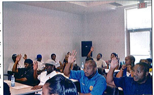
Fatherhood Participants engage in workshop activities

The Meridian Housing Authority hosted its 2nd Annual Fatherhood Initiative and Workshop. The theme of the workshop was "Fathers Make A Big Difference." MHA's Fatherhood Initiative supports HUD's nation-wide outreach effort to encourage the bonding of fathers and their children in addition to connecting fathers to healthy choices and economic development. HUD statistics show that nearly 64%, or two out of three African American children live in "father absent" homes. Studies show that children suffer greatly when there is no father present. Children who live apart from their biological fathers are on average at least 2 to 3 times more likely to: use illegal drugs; experience educational, health, and behavioral problems, or engage in criminal behavior than their peers who live with their married, biological or adoptive parents. A child with an absent father is 54% more likely to become a victim in the vicious cycle of poverty.