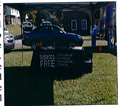
The MS Tobacco Coalition provide smoke-free information

Management and staff encourage all residents to adhere to the new policy. Many more workshops and informative sessions will be held to assist residents in preparing