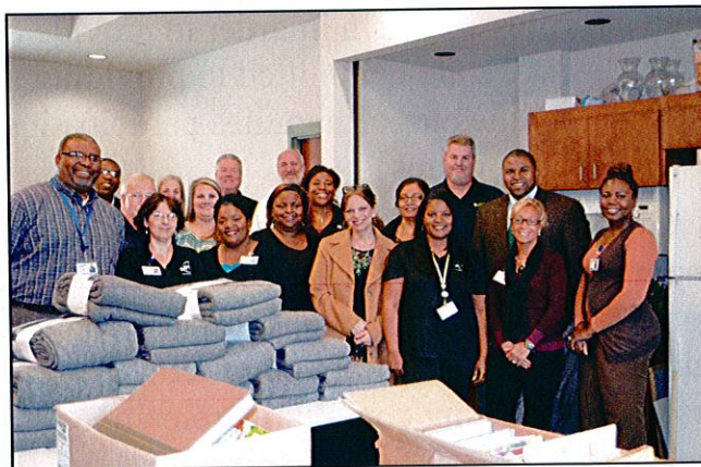
Pictured are members of the Rotary Club of East MS, and MHA Staff

Each year the MHA staff is committed to spreading holiday cheer to its residents. The 2014 holiday committee for the "Books and Blankets" initiative was instrumental in collecting more than 200 books and 180 blankets for second and third grade students residing throughout various MHA neighborhoods. The committee adopted the book campaign to assist and ensure that 3 rd grade students meet the requirements of the Literacy-Based Promotion Act of 2013. MHA would like to remind parents that all 3d grade students will take a test in