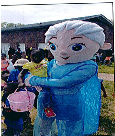
Elsa, the character from Frozen the movie along with MHA residents.