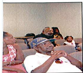
MHA residents listens during MHA's voting workshop.

Meridian Housing Authority's resident and advisory board sponsored a voter's registration workshop on Wednesday, September 21, 2016 at the Eugene F. Young, III (MHA Social Service) building.