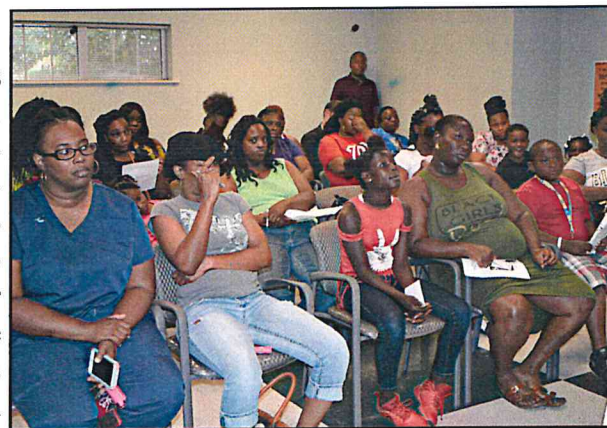
HTP Working session

The Meridian Housing Authority's Housing Transition Program allows MHA residents an opportunity to discover what owning a home requires. HTP participants attend monthly meetings and meet with various community partners to discuss a wide range of topics related to homeownership opportunities. Participants are required to develop spending plans to prepare them for owning their own homes. Negotiating skills relative to securing the best possible mortgage and selecting a banker and realtor are essentials. The participants are exposed to all factors of the home buying process including: insurance, inspections and many of the items needed in order to become informed consumers. HTP meetings are held twice a month from 6:00 p.m. to 7:00 p.m. Please visit www.meridianhousing.net for more information about this program.