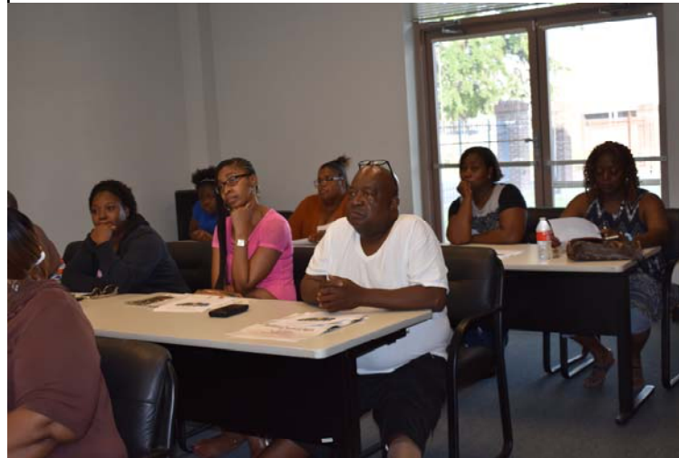
Affordable housing residents interested in owning their own home attending one of the many workshops to prepare them for home ownership