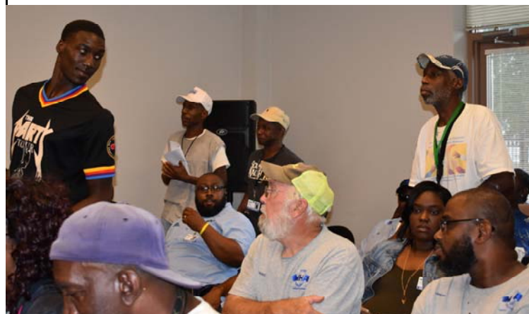
New ESTEEM program participants attend MHA's employee mass meeting