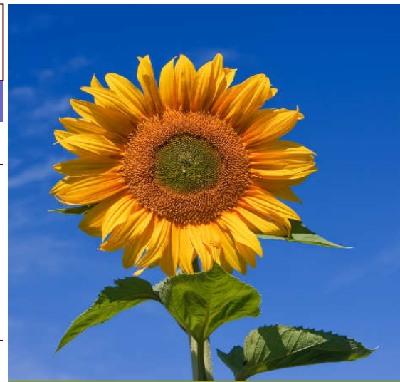
The MHA Home Life Newsletter for Residents