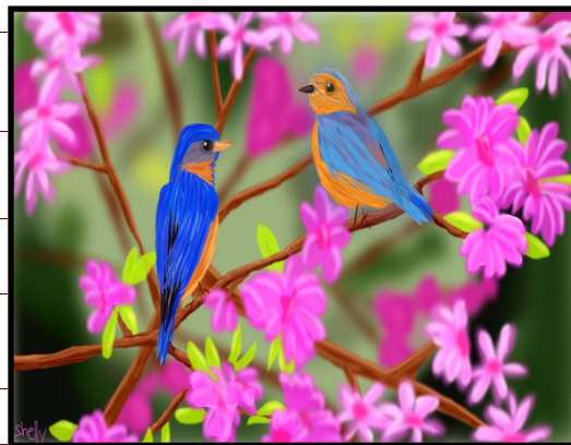
The MHA Home Life Newsletter for Residents

The MHA Home Life Newsletter For Residents is published monthly by the Resident Community & Supportive Services Department. We welcome submissions and we reserve the right to edit all materials used. Materials may be submitted to: