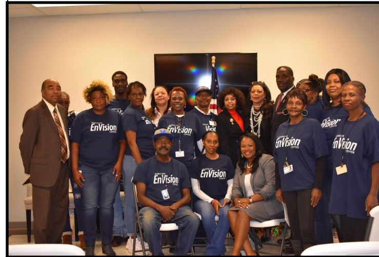
Local community Leaders Including, MHA's Resident Advisory encourages precautioning during pandemic

The core values at the Meridian Housing Authority will continue to focus on putting people first and making responsible decisions as we continue to deal with the negative impact of the national coronavirus pandemic. MHA's top priority remains the well-being of its staff and the valued families we serve throughout all nine of our affordable housing communities.